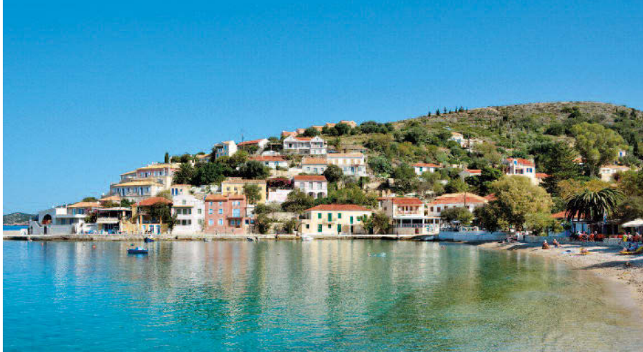
View from Apollonia Studios