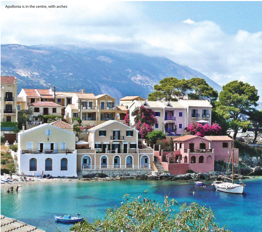
Apollonia is in the centre, with arches

Self Catering Studios for 2 Air Conditioning Free WiFi