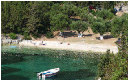
Foki beach, Fiscardo

Self Catering Studios for 2 Apartments for 2/4 Air Conditioning Swimming Pool Free WiFi