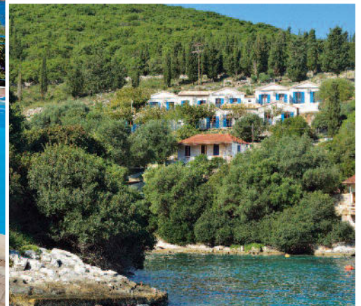
Kaminakia location (centre)