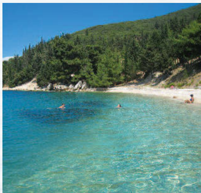
Beach near Sami

Agia Efimia and Sami are fine bases from which to explore the whole of the north. Good road links mean that Argostoli can be reached in under an hour, and the north-west coast in around 20 minutes. Local exploration is enjoyable on foot and our representative will be pleased to lend you a published local walking guide. One popular trail takes you across the island from Agia Efimia in the east to stunning Myrtos beach on the west coast - one of the most photographed beaches in Greece.