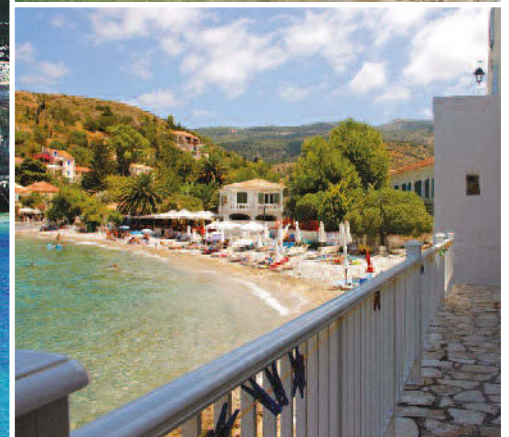
Path to the beach